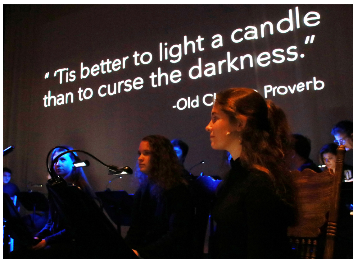
Contributed to The Blue & Gold

As any student on campus will tell you, service is a big part of our experience.