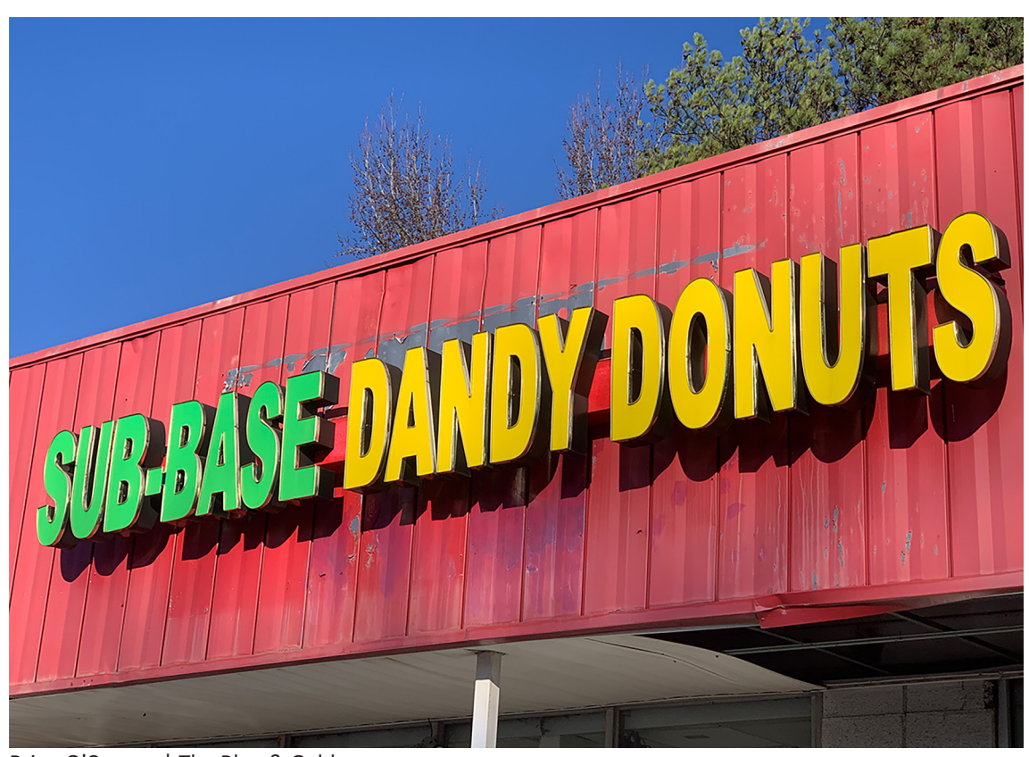
Brian O'Connor | The Blue & Gold

Ticketmaster released an explanation on their website of the reasoning behind their distribution of codes saying, "Around 1.5 million people were sent codes to join the on-sale for all 52 show dates . . . The remaining 2 million Verified Fans were placed on a waiting list."